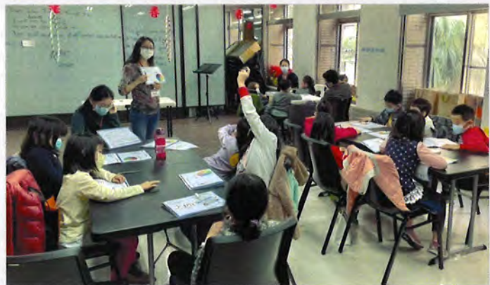
Images: (Center) Linkou Church - Moved into a new facility one month ago (Top) Taiwan earthquake a few days ago (Bottom) Winter English Camp

By the end of 2022, there will be 7 churches planted with your support to CBM! Most of them I have yet to visit, but I look forward to the day when I can travel freely and fellowship with our leaders inside.