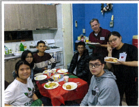
Former, recent, and new students at the Christmas outreach