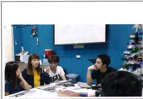
Explaining the creation story using the Jesse tree ornaments