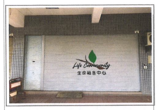
Our logo painted on the center's metal gate