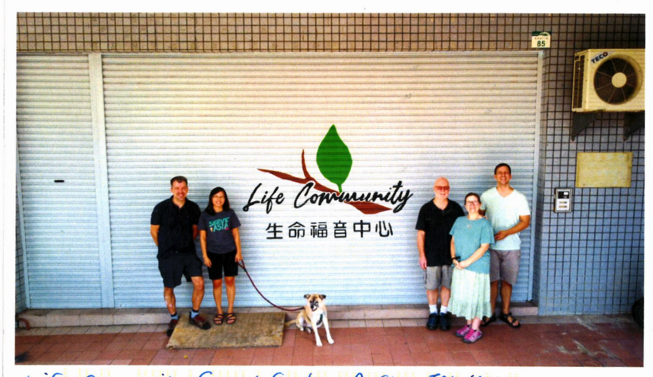
Life Community Gaspel Centre, Dashr, TAIWAN